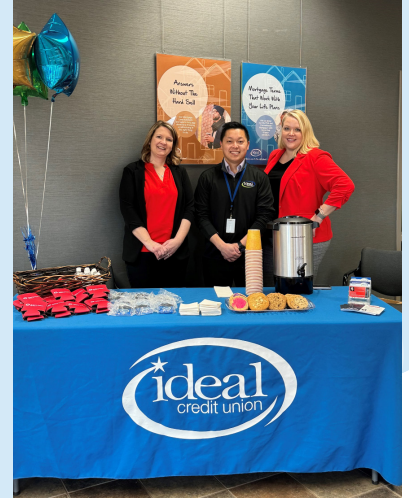
North Saint Paul Lobby Day Hosted by ideal CU and Servion Realty

No Preregistration is required. We can't wait to see you there!