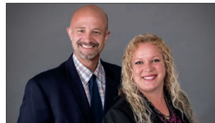
Wealth Advisors Team